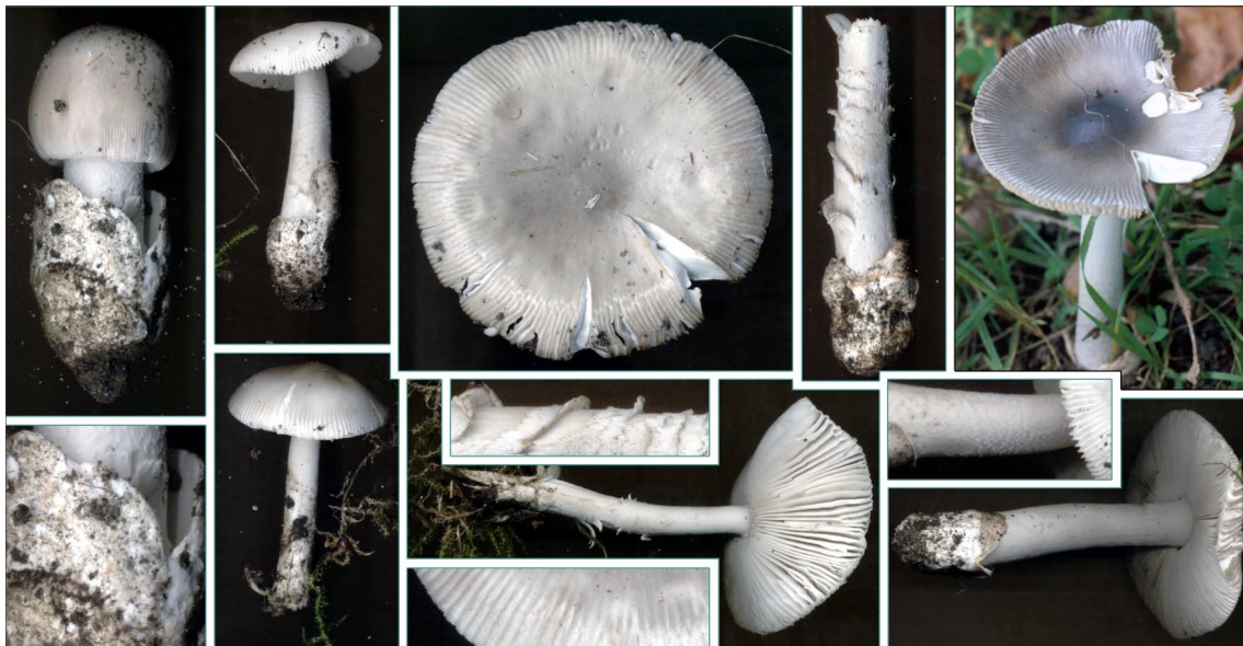
Fig. 1. Fruit bodies of Amanita argentea recorded in Wrocław (coll. 13.09.2001;).