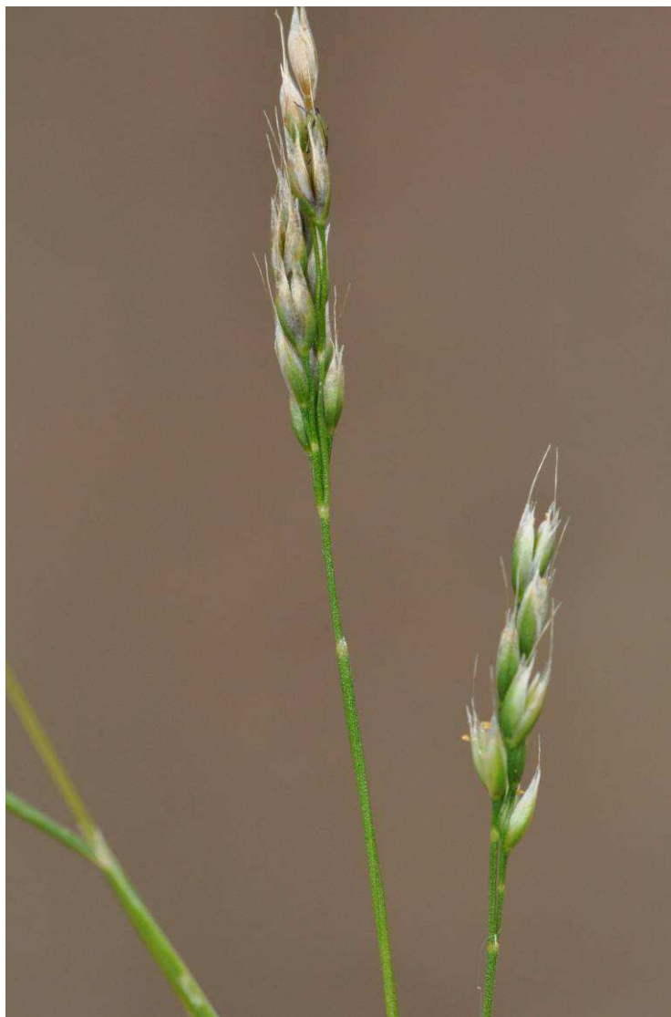
Phot. 1. Aira praecox in Osowiec Śląski in June 2013.