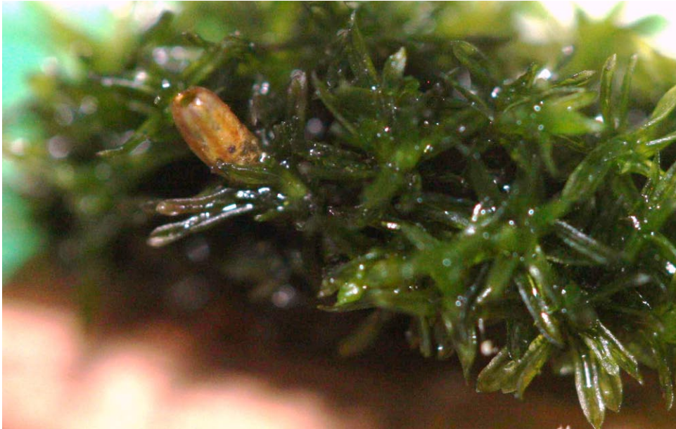
Fig. 1. Orthotrichum rogeri. Specimen from Katowice-Muchowiec housed in herbarium SOSN (7 December 2009,).