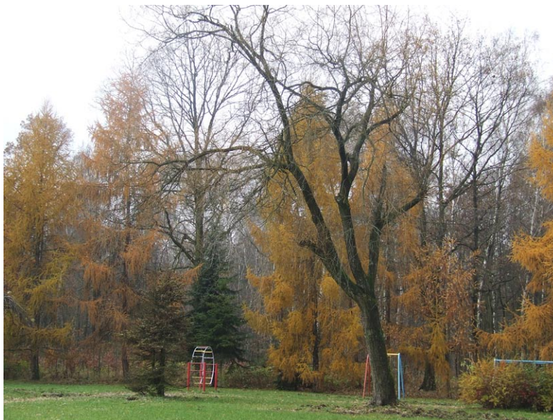
Fig. 2. The willow Salix alba 'Tristis' in Katowice-Muchowiec. On its trunk Orthotrichum rogeri occurred (Katowice-Muchowiec, 13 November 2009).