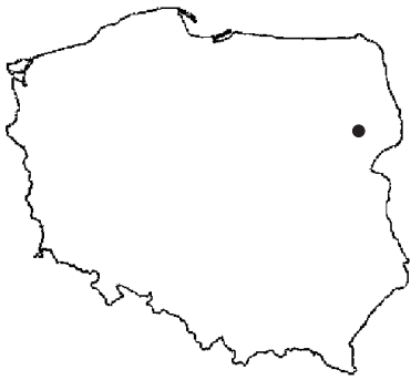
Fig. 1. Location of Mielnik in Poland